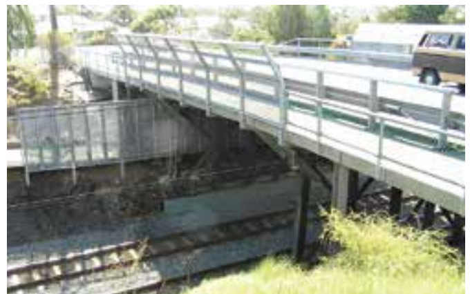
The ageing Ashton Avenue Bridge is being replaced

Over the next few months, you may notice some pre-construction activity occurring as we prepare for this project, including service relocations by Western Power, Water Corporation, Main Roads Western Australia and the Public Transport Authority.